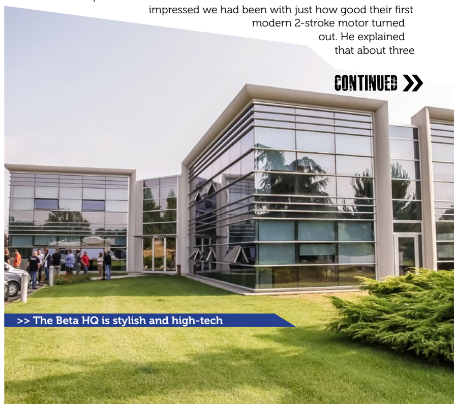
>> The Beta HQ is stylish and high-tech