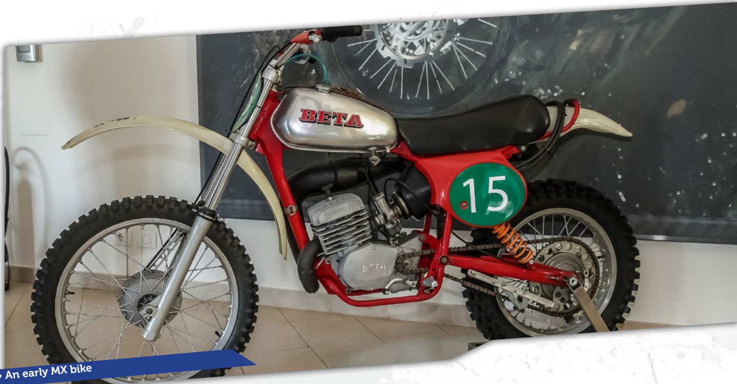
» An early MX bike

The new larger and now translucent fuel tank (9.5 litres) on the 2-strokes will be well received and the improvements to suspension just had to happen. But there are a lot more improvements too: